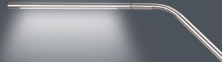
Full spectrum LED task light